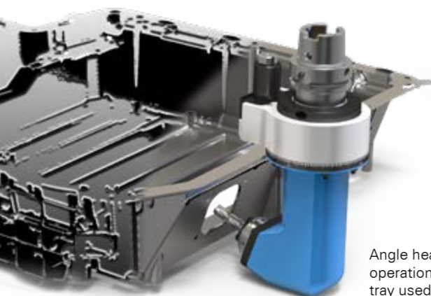
Angle head for milling operations on a battery tray used in electric vehicles.