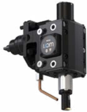
Broaching unit BENZ LinA 4.0