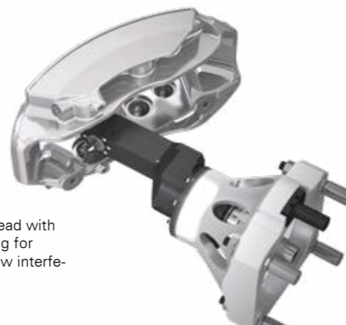
Slim WGx angle head with direct tool clamping for machining in narrow interference contours