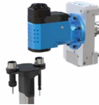
Angle heads with automatic exchange function of the front tools

In the production process quite often a wide range of tooling is used. Utilizing right angle heads capable of automatic front tool exchange enables a wide range of process variations during production.